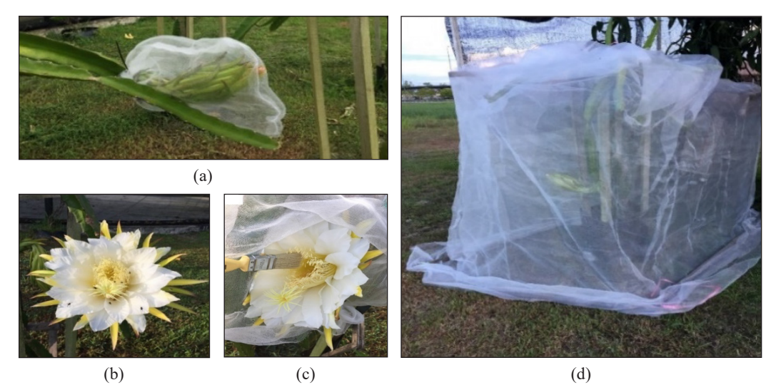
Figure 1 . Treatment for pitaya pollination: (a) self-pollination; (b) natural pollination; (c) hand pollination; and (d) T. laeviceps pollination

part. The flower was bagged in the evening (4.00 p.m.) and hand-pollinated the next day at 6.00 a.m. in the morning. After manual pollination, the flower was bagged until the anthesis closed at 6.30 p.m. to avoid other pollinators. The flower was not bagged in natural pollination, so all pollinators could pollinate it. The types of potential pollinators visiting the flower during the anthesis period were visually observed twice within 24 hr (from 4.30 p.m. to 12:00 a.m. and from 4:00 a.m. to 6:30 a.m.) using the method described by de Oliveira Muniz et al. (2019). For pollination by stingless bees, three hives with strong colonies of T. laeviceps were placed next to the pitaya at least seven days before flowering to allow the stingless bees to acclimatise. The plants and hives were covered with mesh netting the evening before flowering and left covered for 24 hr. The foraging activity of the bees was observed at the three hives in front of the hive entrance tube for ten